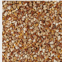
TAJ MAHABLE Red Marble 1-3mm Pink Marble 2-4mm Caramel Marble 2-6mm Red Marble 4-6mm