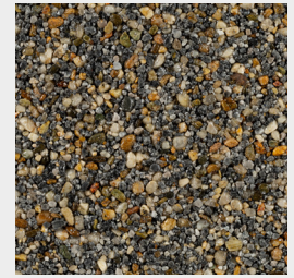
BASTILLE Dark Grey Marble 2-4mm Spanish Quartz 2-6mm Spanish Quartz 2-6mm Dark Grey Marble 4-6mm