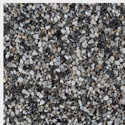
METROPOLIS MARBLE Dark Grey Marble 1-3mm Dark Grey Marble 2-4mm Light Grey Marble 2-6mm Light Grey Marble 2-6mm