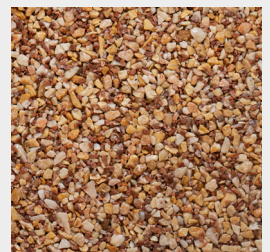
MOROCCAN MARBLE Red Marble 1-3mm Pink Marble 2-4mm Pink Marble 4-6mm Pink Marble 4-6mm