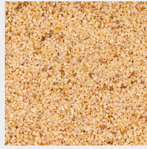
PINK MARBLE 4 x 25kg 2-4mm