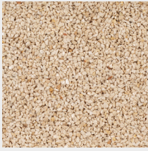
IVORY MARBLE 4 x 25kg 2-4mm