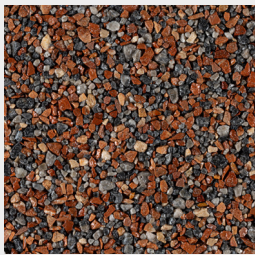
MILANO MARBLE Dark Grey Marble 1-3mm Dark Grey Marble 4-6mm Red Marble 2-4mm Red Marble 4-6mm