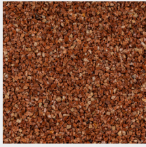
RED MARBLE 4 x 25kg 2-4mm