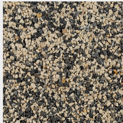
COLORADO Dark Grey Marble 1-3mm Ivory Marble 2-4mm Dark Grey Marble 4-6mm Ivory Marble 4-6mm