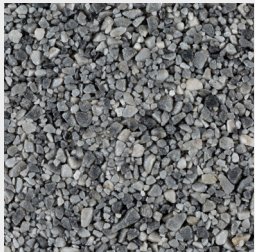
POSEIDON Blue Grey Marble 1-3mm Blue Grey Marble 2-4mm Blue Grey Marble 4-6mm Blue Grey Marble 4-6mm