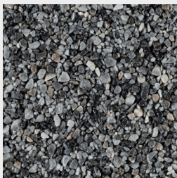
PALAZZO MARBLE Blue Grey Marble 1-3mm Dark Grey Marble 4-6mm Dark Grey Marble 2-4mm Dark Grey Marble 4-6mm