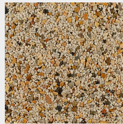
CANNES Ivory Marble 1-3mm Ivory Marble 2-4mm Spanish Quartz 2-6mm Pink Marble 2-4mm