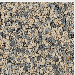
IPANEMA BEACH Blue Grey Marble 2-4mm Blue Grey Marble 4-6mm Ivory Marble 1-3mm Ivory Marble 4-6mm