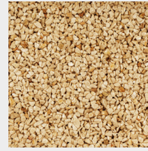
CARAMEL MARBLE 4 x 25kg 2-6mm