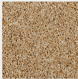
RIALTO BRIDGE Ivory Marble 1-3mm Caramel Marble 2-6mm Caramel Marble 2-6mm Caramel Marble 2-6mm