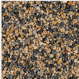
HUKA FALLS Dark Grey Marble 1-3mm Caramel Marble 2-6mm Caramel Marble 2-6mm Dark Grey Marble 4-6mm