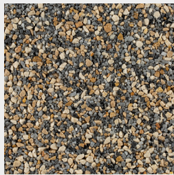
LAKE GARDA Dark Grey Marble 1-3mm Blue Grey Marble 2-4mm Caramel Marble 2-6mm Ivory Marble 4-6mm