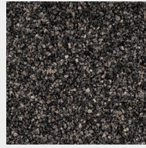
DARK GREY MARBLE 4 x 25kg 2-4mm