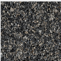
MANHATTAN Dark Grey Marble 1-3mm Dark Grey Marble 2-4mm Dark Grey Marble 4-6mm Dark Grey Marble 4-6mm